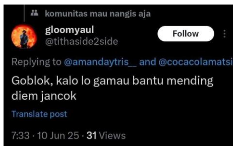
Figure 4. X Tweet

The findings in Table 3 indicate that even discourse intended to challenge gender bias can reproduce verbal sexual violence when delivered through aggressive and confrontational language. Although the tweet aims to defend women’s roles in the economic sector, the argumentative strategy positions women in comparative and confrontational terms, reinforcing gendered binaries rather than fostering egalitarian dialogue. From a gender communication perspective, this form of counter-sexism does not dismantle dominant discourse but instead perpetuates symbolic violence by legitimizing hostility as a mode of engagement. Furthermore, the use of curses and mild hate speech reflects a failure to adhere to ethical standards of digital communication. Instead of promoting rational deliberation, the aggressive delivery blurs the boundary between advocacy and hostility, contributing to the normalization of uncivil interaction in digital public spaces. This finding demonstrates that ethical violations in online discourse are not solely defined by intent, but by communicative impact, where confrontational rhetoric reproduces exclusionary dynamics and undermines constructive gender discourse.