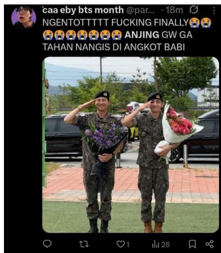
Figure 5. X Tweet

leading to systematic marginalisation: the digital space, which should ideally be democratic, instead becomes a field for the reproduction of power imbalances when dehumanising language is allowed to flourish without social sanctions.