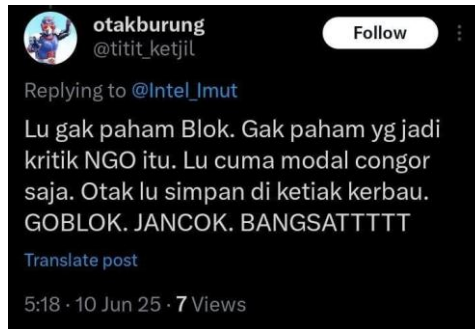
Figure 1. X Tweet

characteristics. The data obtained shows consistent patterns in the use of language containing elements of verbal violence with a sexual orientation.