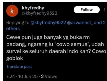
Figure 3. X Tweet

Within the framework of Muted Group Theory, this pattern shows how women who express dissenting opinions immediately face intellectual delegitimation not being refuted argumentatively, but having their capacity for thought attacked. This strategy creates a double silencing: victims are not only silenced through insults, but also constructed as subjects who are "unable to read the situation" so that their opinions are considered unworthy of being heard. The normalisation of attacks on women's intellectuality on Platform X reflects the failure of digital communication ethics and the reproduction of patriarchy, which positions women as a muted group with no control over the validity of their own voices.